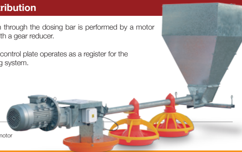
Feeding system with control by gearmotor

New control plate suitable for lines of INDIV feeders like other brands.