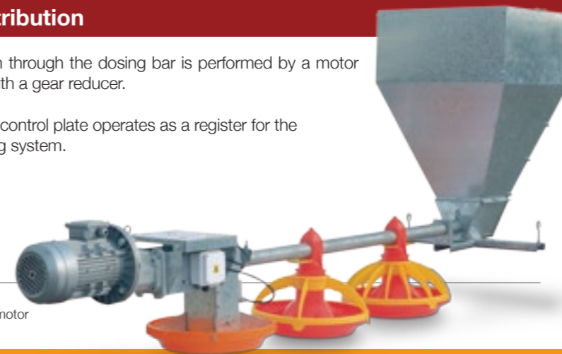
Feeding system with control by gearmotor

New control plate suitable for lines of INDIV feeders like other brands.