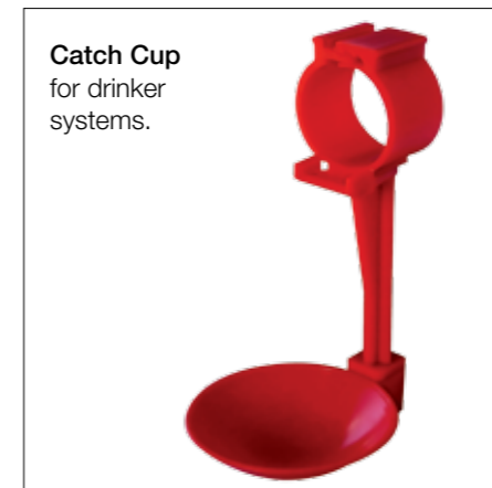
Catch Cup for drinker systems.