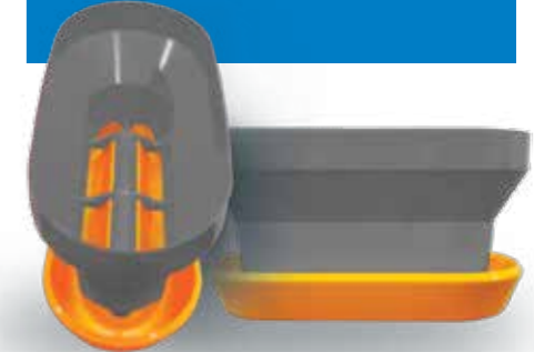
TurboGrow 2 - Complementary Feeder Placed between the pans of an automated feeder system, it allows more room for movement between pans, so that the birds eat as much from the chick feeder as from the feeder pan.

The design of the pan offers more than 39" of feed space.