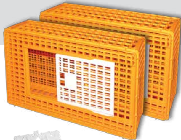
Mini Piedmont Coop Dimensions: 30 5/16 x 22 7/16 x 11 in and 30 5/16 x 22 7/16 x 13 in