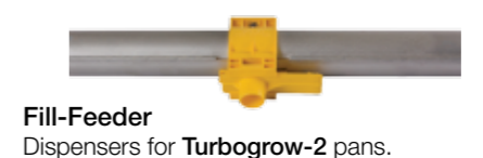
Fill-Feeder Dispensers for Turbogrow-2 pans.

Feed dispensers for all types of metal tubes