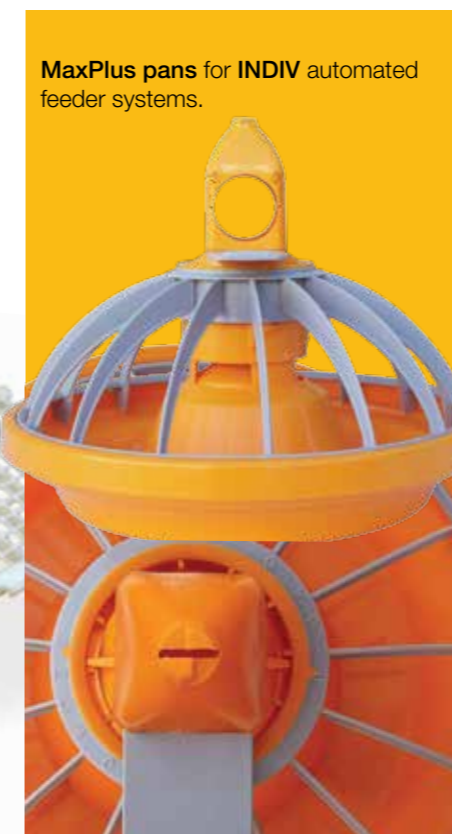
MaxPlus pans for INDIV automated feeder systems.

The design of the pan offers more than 39" of feed space.