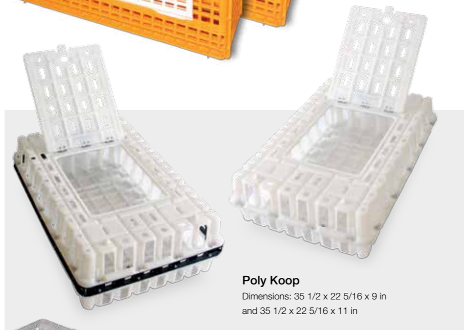
Poly Koop Dimensions: 35 1/2 x 22 5/16 x 9 in and 35 1/2 x 22 5/16 x 11 in