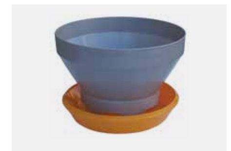
Turbogrow - Supplementary Feeder Can be placed throughout the house and filled manually.