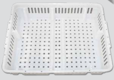
Chick boxes. With or without divisions. Dimensions: 26 x 19 9/16 x 6 in