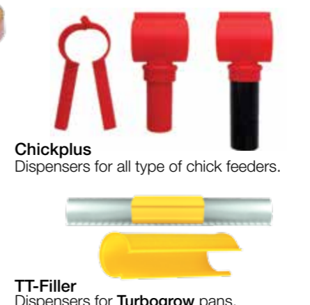
Chickplus Dispensers for all type of chick feeders.